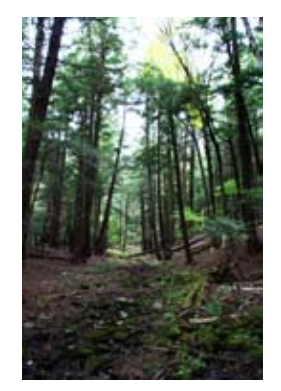
New York State

One major aim is to reduce the widespread persecution of birds of prey throughout the UK.